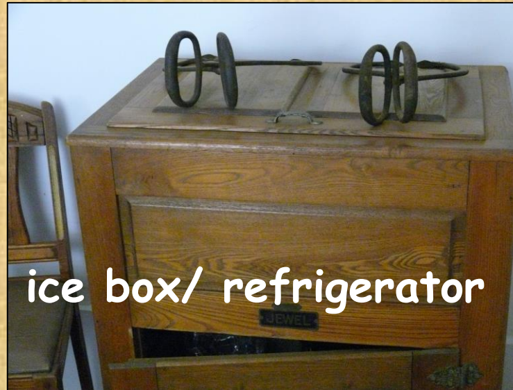
ice box/ refrigerator